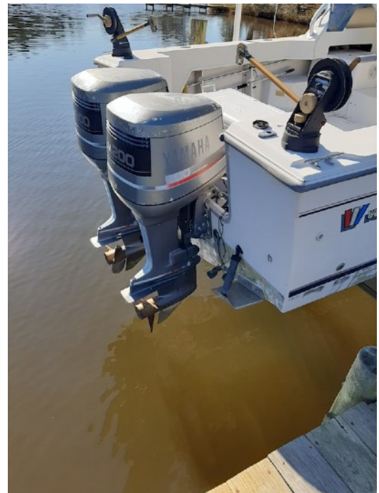
Wellcraft 26 200HP Yamahas