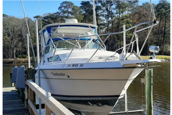
Wellcraft 26 on boat lift

Featured this month is a 1991 Wellcraft, 2600 with: twin 200 Yamaha outboards with counter rotating props; sea star steering; trim tabs; radar; Garmin fish finder; bridge enclosure by Marine Fabricators of Topping, Virginia; head; galley; and live well. Engines just checked over for Rockfish season. Priced at $15,000.