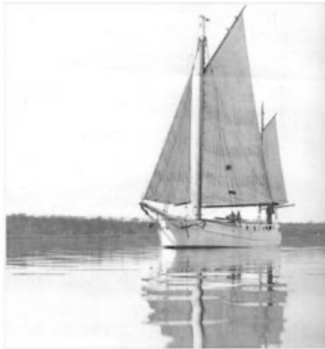
The Basilisk in full sail

While working on this project, we discovered that the Basilisk was one of two replicas of Joshua Slocum's Spray built at Conley's Shipyard. It appears that these two are among the most exact replicas of the original Spray and