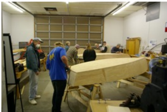
Pictured here are boatbuilders at our second building session at our Gwynn's Island Boat Shop.

Youth who build these boats will see their work and will be able to witness how their work is benefiting others when they attend camp. They will have an opportunity to leave a legacy.