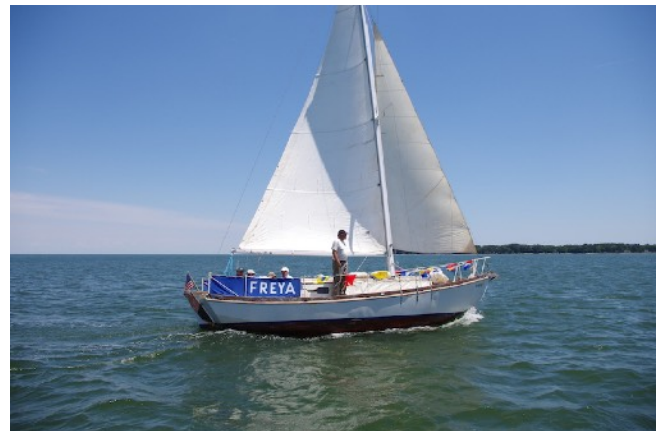
Freya under sail in Hills Bay

At this juncture, Freya needs further repairs. I am hoping for a new crew to continue her restoration. To accomplish this goal we are in need of monetary or material contributions to haul her out and clean and paint her bottom. In addition, she needs a new toe rail all around and re-construction of her deck house. She was a classic when built and is so deserving of restoration. I am hopeful to find a new crew here in Mathews to bring her back