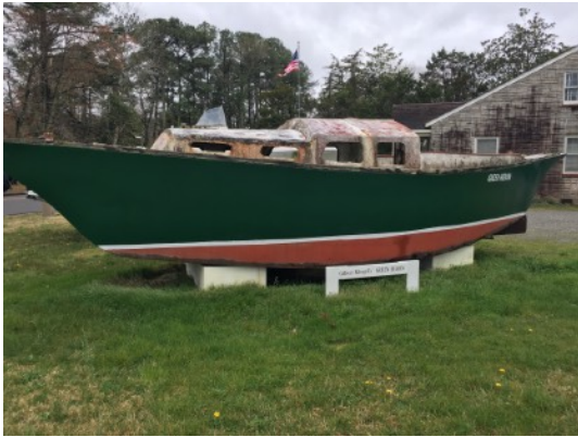
Freya as static display at MMF Museum on Main Street, Mathews

She had been abandoned for 50 years outside of Urbanna, Virginia. We found her, transported her to Mathews and put her in storage while we debated whether to restore her or move her to our Museum as a static display. Well, decision made, she was moved to the MMF Museum last September to be preserved as a unique vessel. We need to