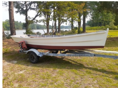
The John Gardner 15' flat bottom skiff

Recent projects include the building of a John Gardner lapstrake rowing skiff and a 10-