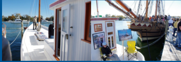
The view of The Mathews Maritime Foundation

Museum Located at 482 Main Street, Mathews, VA Mail to PO Box 1201, Mathews, VA 23109 804-725-4444 on the web at www.mathewsmaritime.com