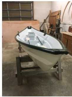
Before and after restoration

16' Flat bottom juniper skiff that was so badly eaten by worms that most of the bottom planks and a section of the starboard chine log and side plank had to be replaced.