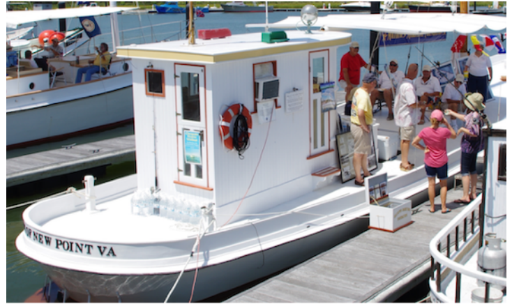
Peggy dockside at CBMM, St Michaels.

After an especially pleasant voyage down the Bay to her Gwynns Island home, our flagship/ambassador was due for some R&R. She received a fresh coat of paint on her decks and some fine-tuning of her running gear. Then it was away for Urbanna and the Education Day activities held annually prior to the Oyster Festival. This was PEGGY's third year of participation with school children from Middlesex County, and beyond. We always have enthusiastic responses from the students to our "chores of pound net-fisherman" activity. Over the following weekend, numerous visitors to this end-of-season classic took time to inquire about the missions and the goals of the Mathews Maritime Foundation. To learn more about the PEGGY of NEW POINT, and what kind of marathon this venerable old girl will be up to as 2017 unfolds, be sure to check our MMF web page or visit with us on Facebook.