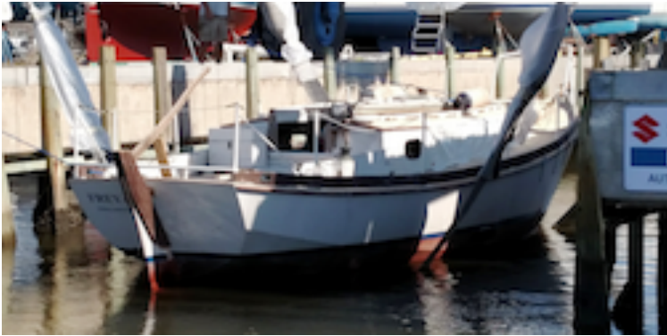
Freya in slings at St. Augustine, Fl.

For more information about the Freya, the man who built her and the Gwynn's Island boat shop where she was built go to www.gilbertklingel.com