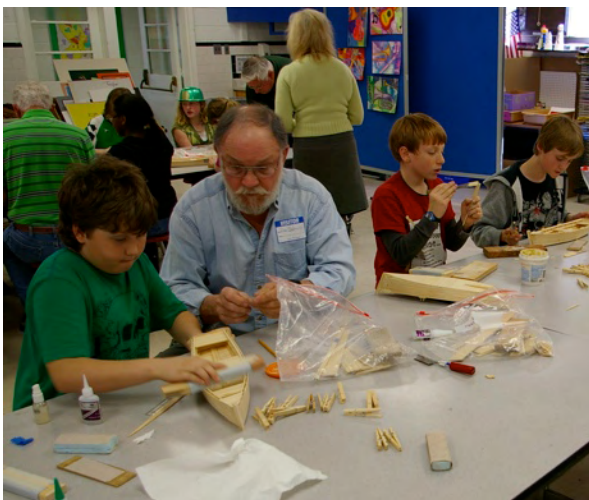
Builders assembling their boats