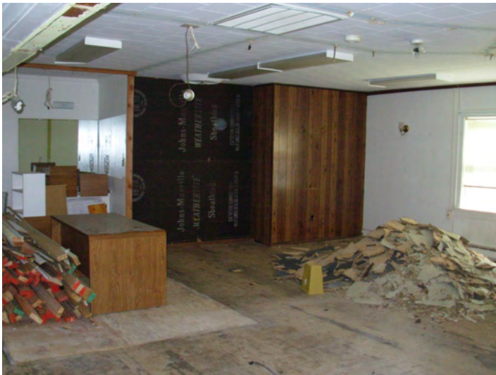
Museum at start of renovations

The building that now houses the Mathews Maritime Museum has been many things over the years, but to meet the needs of a museum many changes and repairs had to be done. The leaky roof was replaced, and then attention shifted to the labyrinth interior full of dark rooms. Three offices, two bathrooms, and a hallway were removed which opened up the current main room that now serves as a display area, or a gathering place for our speaker's meetings. Also, the complete renovation of the bathroom was done, including replacing floor joists and all plumbing, to create a sound structure that can now accommodate handicapped individuals.