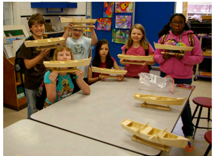
Builders display their finished boats...

Keeping the Past in the Present Preserving it for the Future