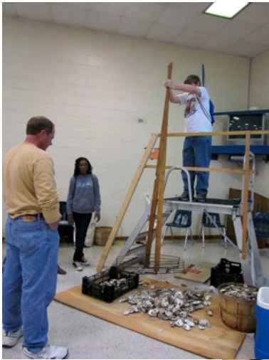
Tonging for oysters