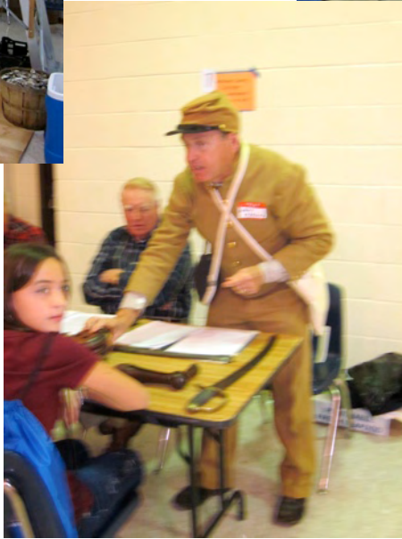
Mathews Civil War artifacts...