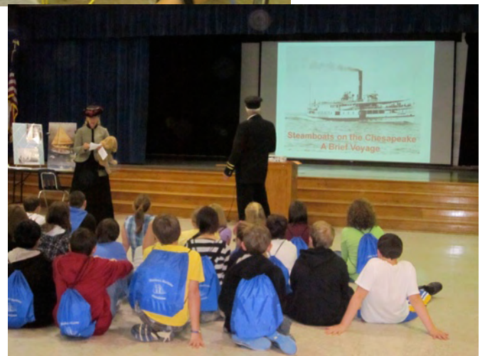
Learning about steam boat travel...