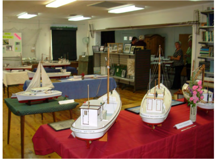
Museum after renovation