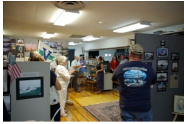
Reception for tuggers and pilots at MMF Museum

Calendars are on sale at the Mathews Visitors Center and from the Mathews Maritime Museum's online gift shop at <mathewsmaritime.com>.