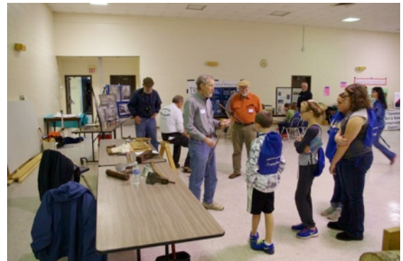
Future members of MMF learning about the maritime history of Mathews County