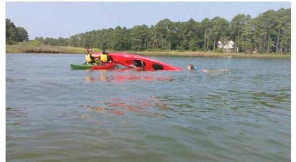
Kayakers practicing rescue techniques

Most of the kids who came to kayak camp this year had already done a bit of paddling prior to the camp and even those who had never been in a kayak before were very quick to learn. We were amazed at how soon they were able to move on to advanced safety skills such as water rescues.