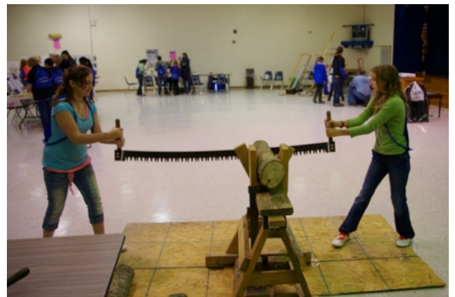
Middlesex Students using the two man saw

This talk was followed by a hands-on experience as the students cut logs using a two-man saw. Approximately 240 students participated before the day was done.